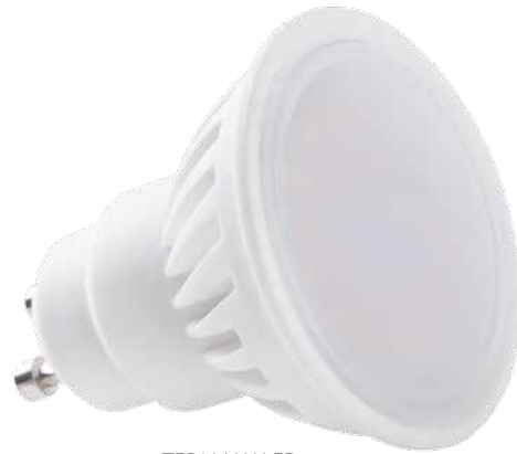
TEDI MAX LED GU10-CW