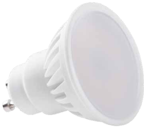
TEDI MAX LED GU10-WW