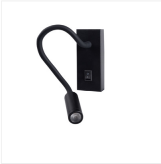
TONIL II LED B