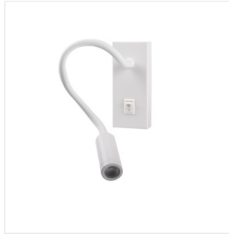
TONIL II LED W